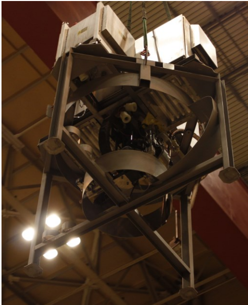
Theory in motion: the redesigned equipment craned