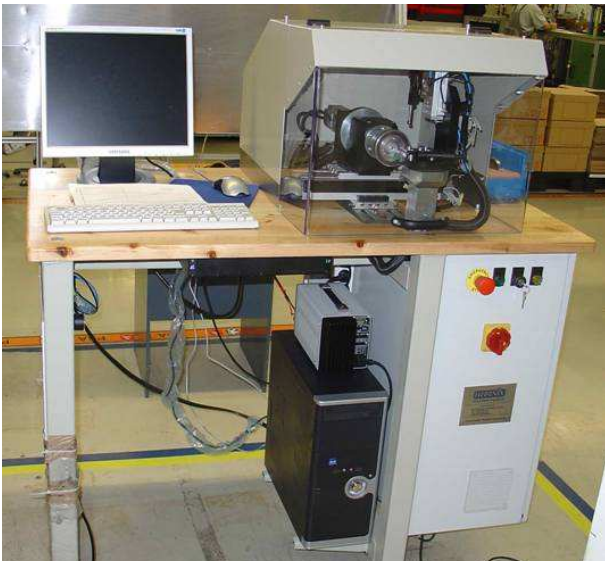
The machine after installation, ready for measurement